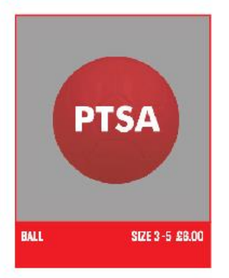
Pro Touch SA is a company limited by guarantee. Registered in England No. 6036922