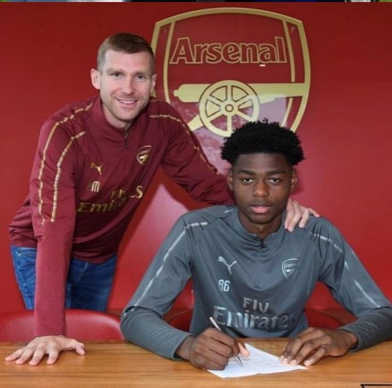
Photographs copywrite of Arsenal FC, Watford FC and Pro Touch SA